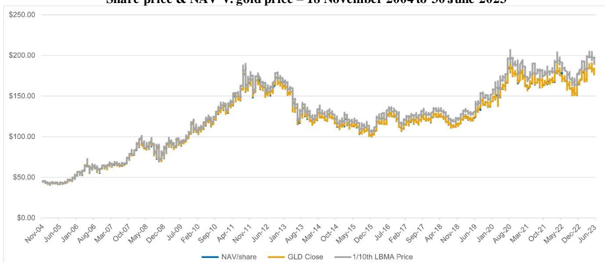
Share price & NAV v. gold price – 18 November 2004 to 30 June 2023

The following chart provides historical background on the price of gold. The chart illustrates movements in the NAV per Share compared to movements in the price of gold in U.S. dollars per ounce over the period from the day the Shares began trading on the NYSE on 18 November 2004 to 30 June 2023, and is based on the previous gold pricing benchmark, the London PM Fix (as defined below), before it was replaced by the 3:00 p.m. London time LBMA Gold Price (the " LBMA Gold Price PM ") on 20 March 2015. London Gold Market Fixing Limited had been publishing a fix during London trading hours, which provided reference gold prices for the day's trading (the " London Fix "). Market participants usually referred to either the morning (AM) or afternoon (PM) London Fix (the " London PM Fix ") when looking for a basis for valuations.