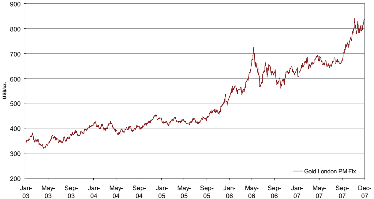
Daily gold price - January 1, 2003 to December 31, 2007

The following chart provides historical background on the price of gold. The chart illustrates movements in the price of gold in US dollars per ounce over the period from January 1, 2003 to December 31, 2007, and is based on the London PM Fix.