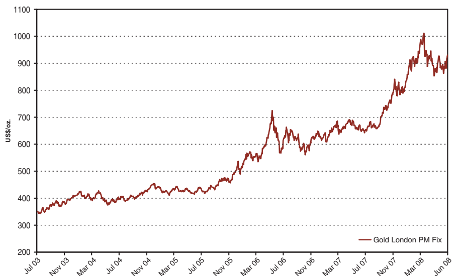
Daily gold price - July 1, 2003 to June 30, 2008

After reaching a 20-year low of $252.80 per ounce at the London PM Fix on July 20, 1999, the gold price gradually increased. The average gold price for 2003 was $363.32 per ounce, the average for 2004 was $409.17 per ounce and the average for 2005 was $444.45 per ounce. During the year 2006, the gold price ranged between a low of $524.75 on January 5, and a high of $725.00 on May 12, with the average for the year being $603.77. In the first eight months of 2007 the gold price traded in a range between a low of