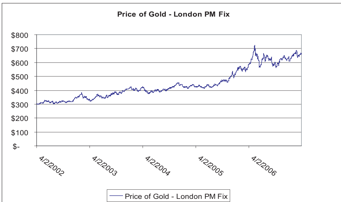
Five Year Daily Gold Price ($US/ounce)

The average, high, low and end-of-period gold prices for the period from the inception of the Trust on November 12, 2004, through March 31, 2007, based on the London PM Fix, were: