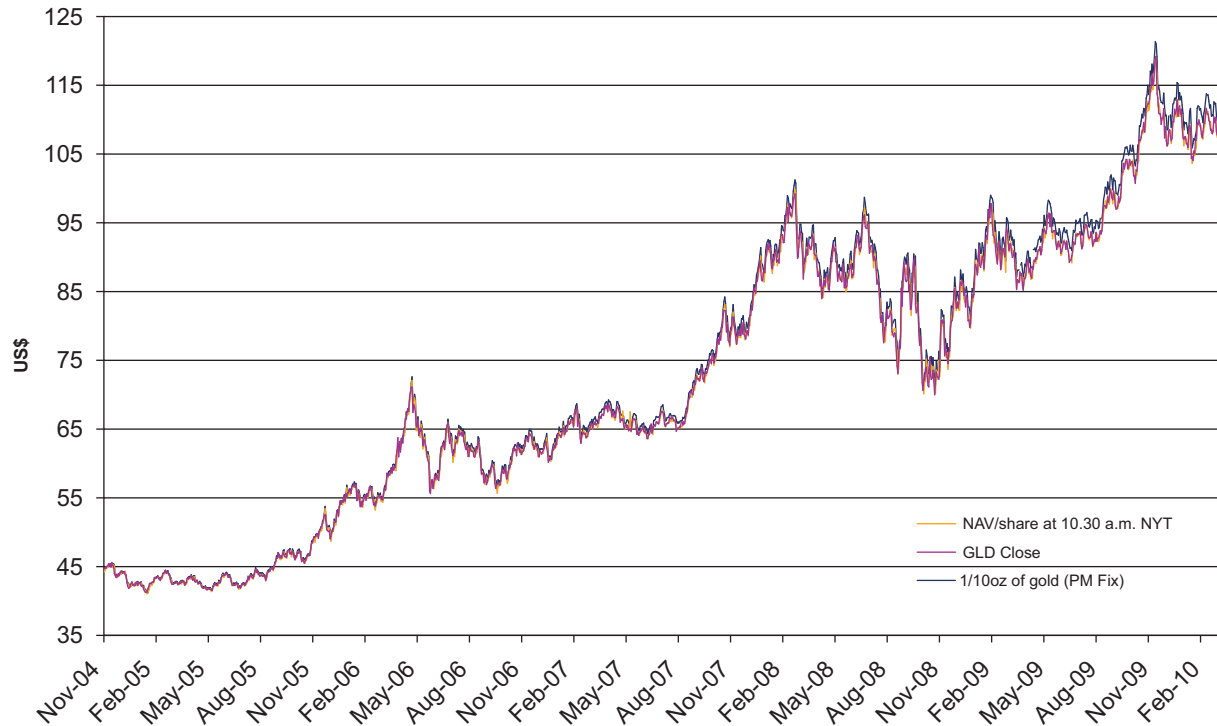
Share & gold price v. NAV from Date of Inception to March 31, 2010

The cumulative effect of the Trust’s expenses since the Date of Inception is reflected in the divergence of the price of the Shares and NAV of the Shares from the gold price over time.