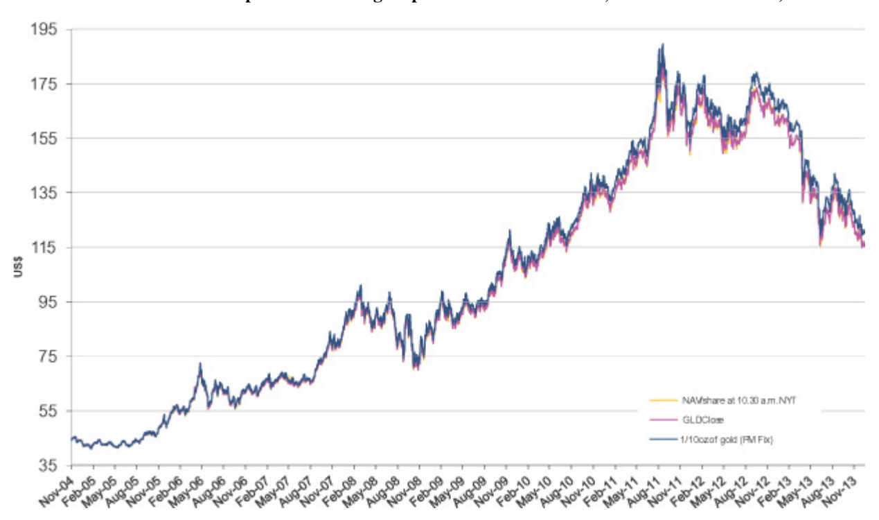
Share price & NAV v. gold price from November 18, 2004 to December 31, 2013

Investing in the Shares does not insulate the investor from certain risks, including price volatility. The following chart illustrates the movement in the price of the Shares and NAV of the Shares against the corresponding gold price (per 1/10 of an oz. of gold) since the day the Shares first began trading on the NYSE: