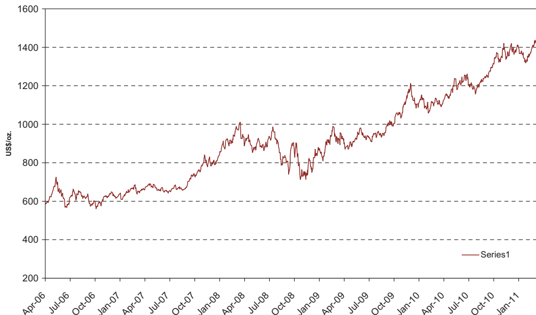
Daily gold price - April 1, 2006 to March 31, 2011

The average, high, low and end-of-period gold prices for the three and twelve month periods over the prior three years and for the period from the Date of Inception through March 31, 2011, based on the London PM Fix, were: