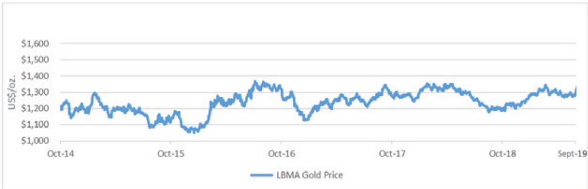
Daily Gold Price – October 1, 2014 to September 30, 2019

During the year between October 1, 2018 and September 30, 2019, the gold price based on the LBMA Gold Price PM traded between $1,185.55 per ounce (October 9, 2018) and $1,546.10 per ounce (September 4, 2019), and the average price was $1,329.69.