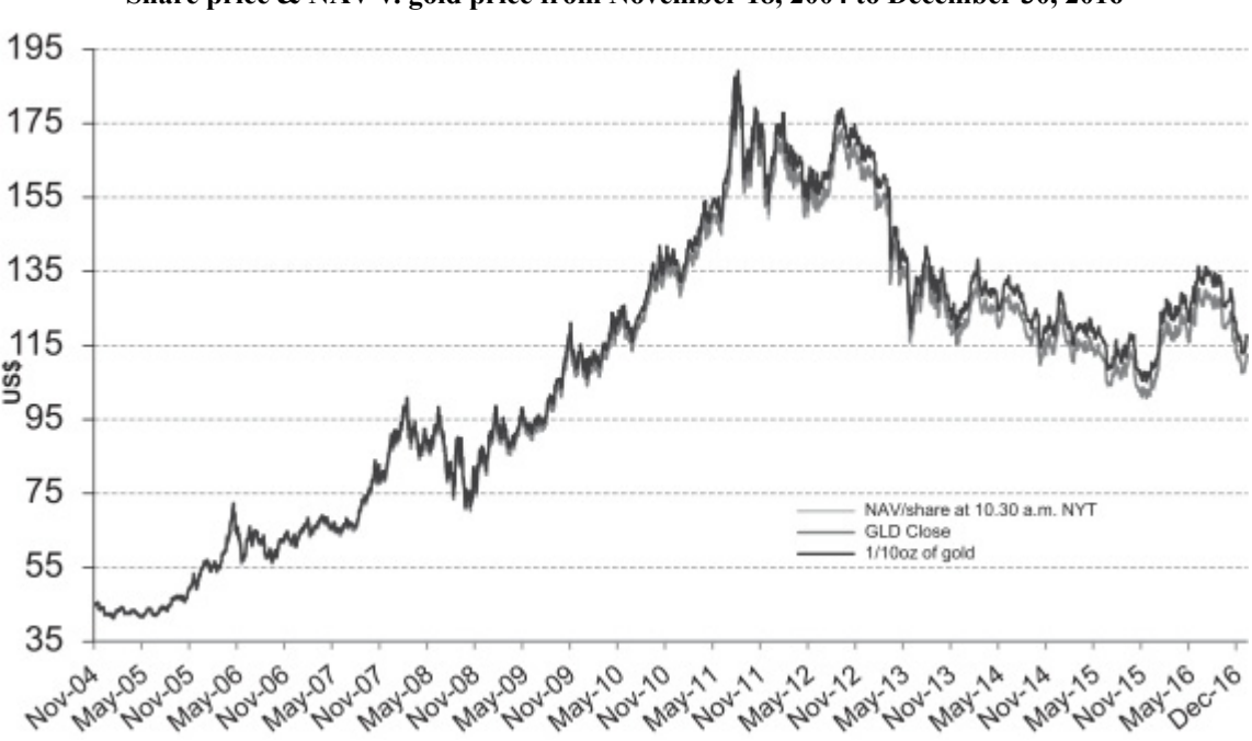
Share price & NAV v. gold price from November 18, 2004 to December 30, 2016

Investing in the Shares does not insulate the investor from certain risks, including price volatility. The following chart illustrates the movement in the price of the Shares and NAV of the Shares against the corresponding gold price (per 1/10 of an oz. of gold) since the day the Shares first began trading on the NYSE: