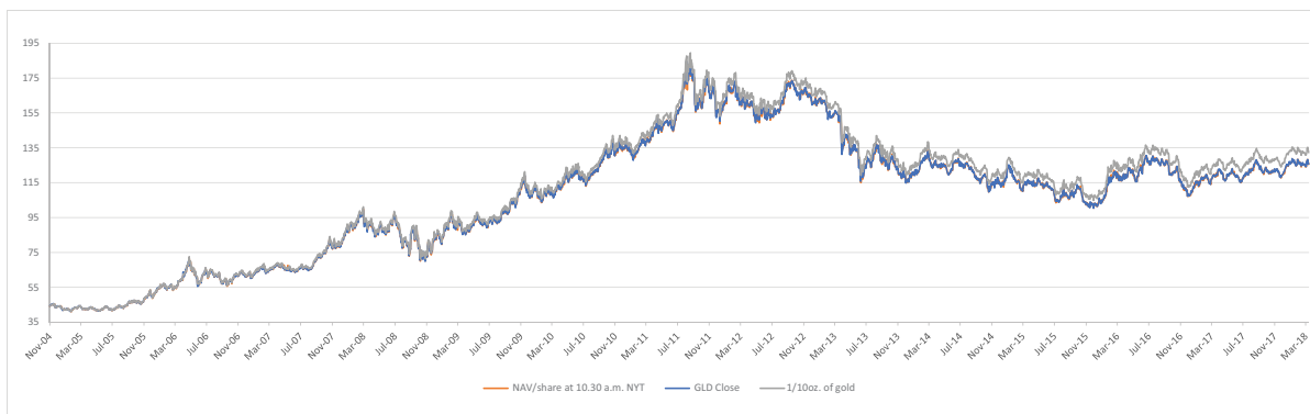
Share price & NAV v. gold price - November 18, 2004 to March 31, 2018

The divergence of the price of the Shares and NAV of the Shares from the gold price over time reflects the cumulative effect of the Trust expenses that arise if an investment had been held since inception.