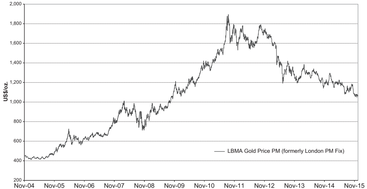
Daily gold price - November 18, 2004 to December 31, 2015

The following chart provides historical background on the price of gold. The chart illustrates movements in the price of gold in U.S. dollars per ounce over the period from the day the Shares began trading on the NYSE on November 18, 2004 to December 31, 2015, and is based on the LBMA Gold Price PM since March 20, 2015 and previously the London PM Fix.