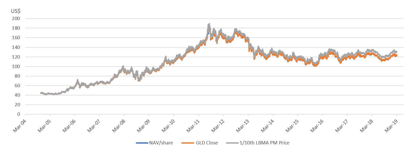
Share price & NAV v. gold price from 18 November 2004 to 31 March 2019

The following chart provides historical background on the price of gold. The chart illustrates movements in the NAV per Share compared to movements in the price of gold in U.S. dollars per ounce over the period from the day the Shares began trading on the NYSE on 18 November 2004 to 31 March 2019, and is based on the previous gold pricing benchmark, the London PM Fix (as defined below), before it was replaced by the 3:00 p.m. London time LBMA Gold Price (the "LBMA Gold Price PM") on 20 March 2015. London Gold Market Fixing Limited had been publishing a fix during London trading hours, which provided reference gold prices for the day's trading (the "London Fix"). Market participants usually referred to either the morning (AM) or afternoon (PM) London Fix (the "London PM Fix") when looking for a basis for valuations.