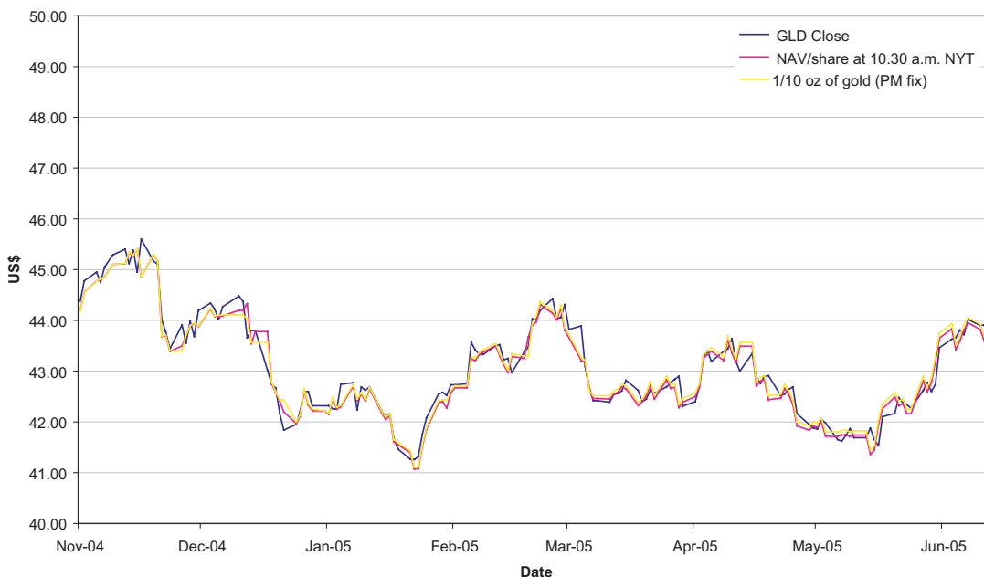
Share & gold price v. NAV from fund inception to June 30th, 2005

Investing in the Shares does not insulate the investor from certain risks, including price volatility. The following chart illustrates the movement in the price of the Shares against the corresponding gold price (per 1/10 of an oz. of gold):