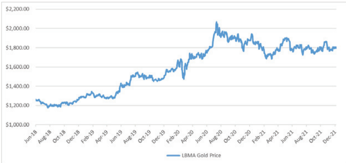
Daily Gold Price - June 26, 2018 to December 31, 2021 LBMA Gold Price PM USD

The following chart shows movements in the price of gold based on the LBMA Gold Price PM in U.S. dollars per ounce over the period from June 26, 2018 (the first date the Shares began trading on the NYSE Arca) to December 31, 2021.