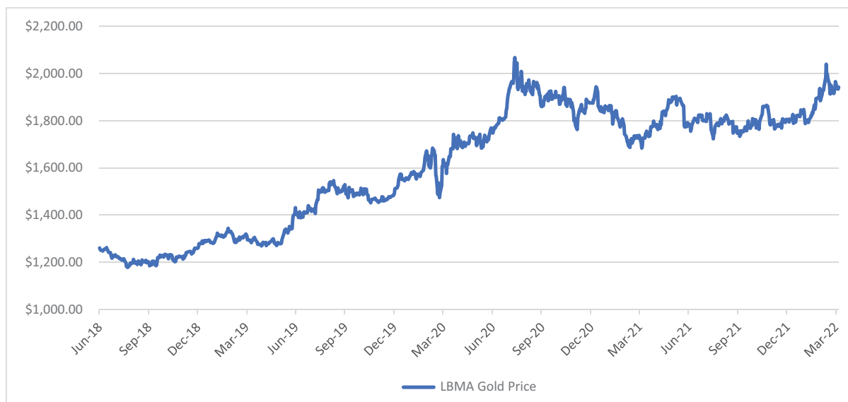
Daily Gold Price - June 26, 2018 to March 31, 2022 LBMA Gold Price PM USD

The average, high, low and end-of-period gold prices for the three and twelve-month periods over the prior three years and for the period from June 26, 2018 (the first date the Shares began trading on the NYSE Arca) through March 31, 2022, based on the LBMA Gold Price PM, were: