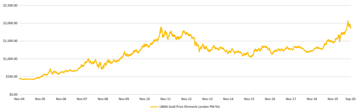
Daily Gold Price - November 18, 2004- September 30, 2020

The following chart provides historical background on the price of gold. The chart illustrates movements in the price of gold in U.S. dollars per ounce over the period from the day the Shares began trading on the NYSE on November 18, 2004 to September 30, 2020, and is based on the LBMA Gold Price PM when available from March 20, 2015 and previously the London PM Fix.