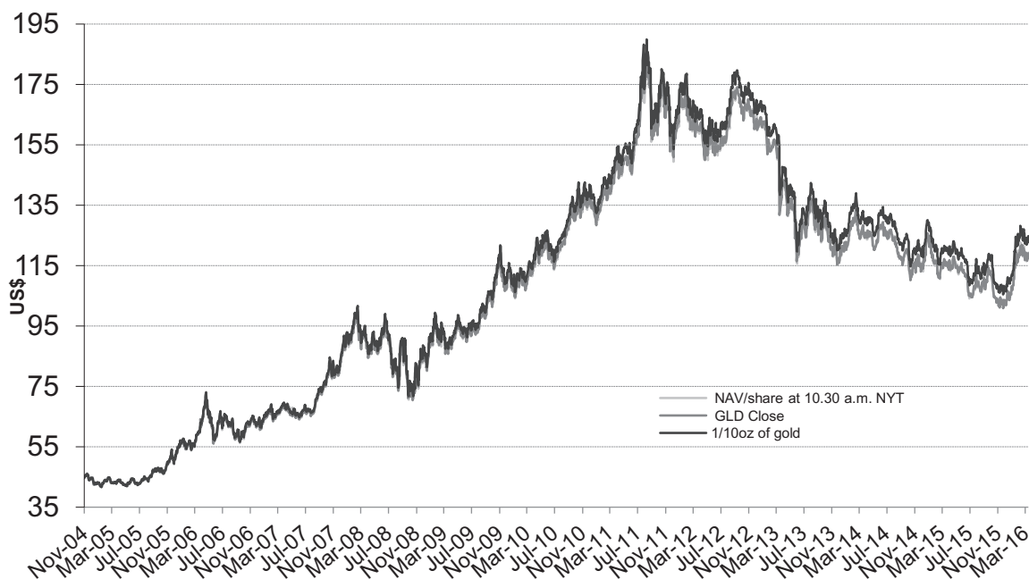
Share price & NAV v. gold price from November 18, 2004 to March 31, 2016

Investing in the Shares does not insulate the investor from certain risks, including price volatility. The following chart illustrates the movement in the price of the Shares and NAV of the Shares against the corresponding gold price (per 1/10 of an oz. of gold) since the day the Shares first began trading on the NYSE: