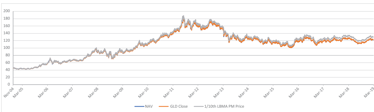
Share price & NAV v. gold price – November 18, 2004 to March 31, 2019

The divergence of the price of the Shares and NAV of the Shares from the gold price over time reflects the cumulative effect of the Trust expenses that arise if an investment had been held since inception.