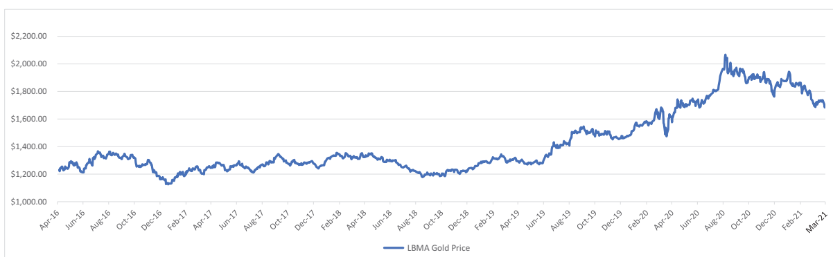
Daily Gold Price - April 1, 2016 - March 31, 2021 LBMA Gold Price PM USD

The average, high, low and end-of-period gold prices for the three and twelve-month periods over the prior three years and for the period from the Date of Inception through March 31, 2021, based on the LBMA Gold Price PM when available from March 20, 2015 and previously the London Fix, were: