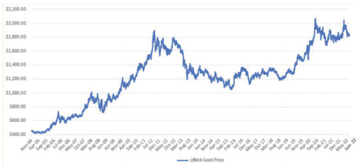
Daily Gold Price – November 12, 2004 – June 30, 2022 LBMA Gold Price PM USD

The average, high, low and end-of-period gold prices for the three and twelve-month periods over the prior three years and for the period from the Date of Inception through June 30, 2022, based on the LBMA Gold Price PM when available from March 20, 2015 and previously the London Fix, were: